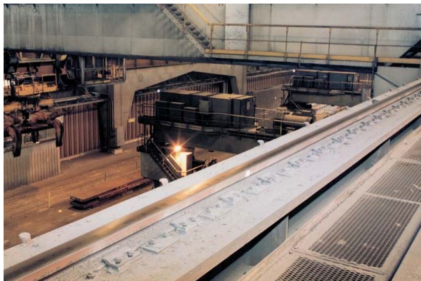
Sollac Dunkerque (F) - Weldable clips