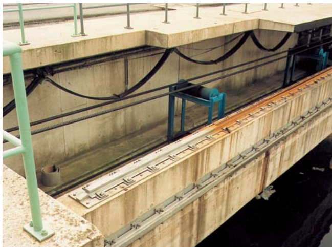
Sea-lock Zeebrugge (B) - Boltable clips

Designed as stress resistant, their mechanical performances have been certified by demanding and highly specified tests carried out by the Evaluation Laboratory for Rail Tracks Construction in München (Germany).