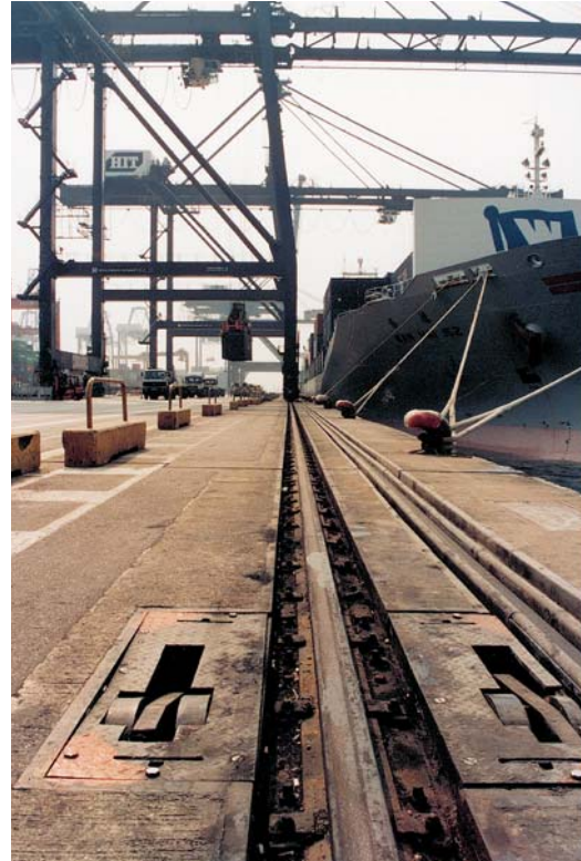
HIT (Hong Kong) - Weldable clips