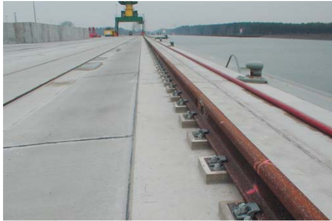
Landside port Eberswalde (D) – Boltable clips