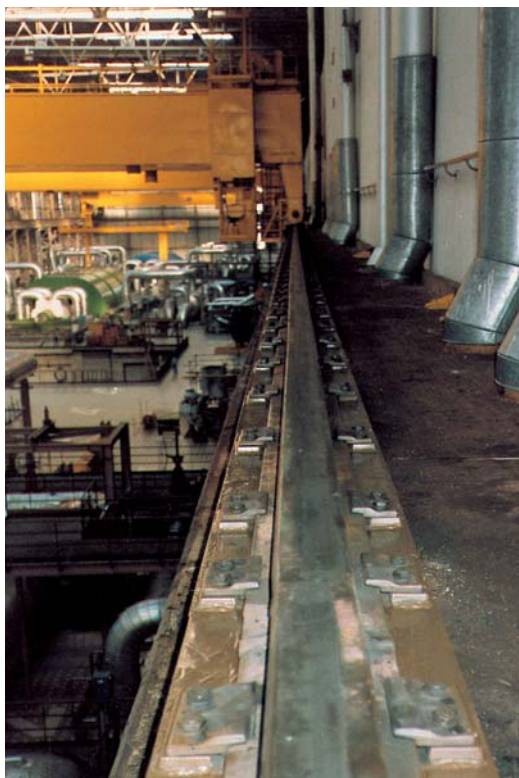
Nuclear Power Station Tricastin (F) - Weldable clips