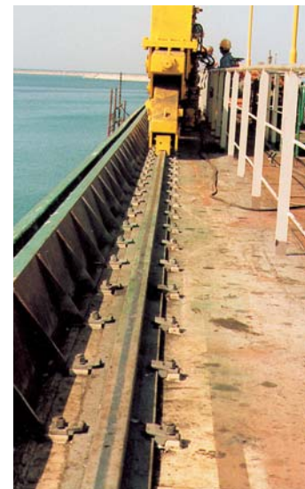
Dubai Drydocks (UAE) – Weldable clips

We reserve the right to discontinue or change specifications or design at any time without prior notice and without incurring any obligation whatsoever.