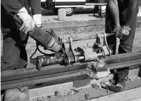
Hydraulic shearing with flat blades